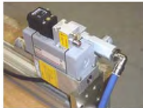
OEM supplied solutions (from left to right): Blow nozzle valve, high pressure pilots, stretch rod cylinder valve

MAC Valves, Inc. has carefully analyzed the requests of users and understood their needs for developing a range of drop-in solutions to upgrade existing machinery.