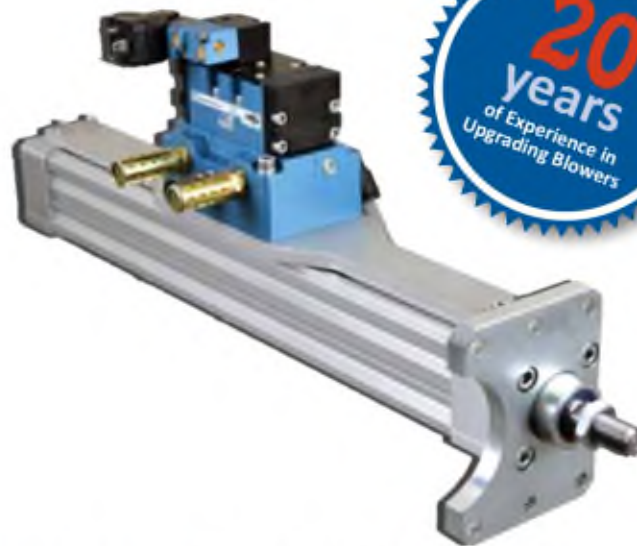
Example of solution: Mac Valves ISO2 on PHD Inc. BCK stretch rod cylinder

MAC Valves, Inc. has developed 100% drop-in solutions to replace OEM supplied solenoid valves installed on injection stretch blow moulders